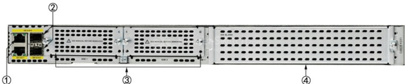
Figure 3 shows the back panel of Cisco ISR4331/K9.