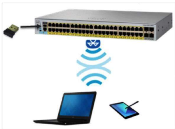
Figure 2. Over-the-air switch access using Bluetooth